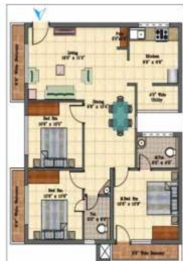
SLV 006 E Facing Total area 1355sqft 3 BHK