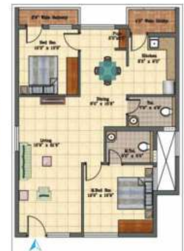
SLV 008 W Facing Total area 1155sqft 2 BHK