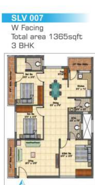
SLV 007 W Facing Total area 1365sqft 3 BHK