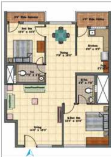
SLV 001 W Facing Total area 1180sqft 2 BHK