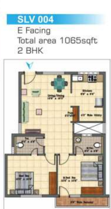
SLV 004 E Facing Total area 1065sqft 2 BHK