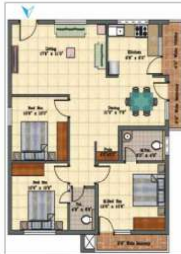
SLV 003 E Facing Total area 1355sqft 3 BHK