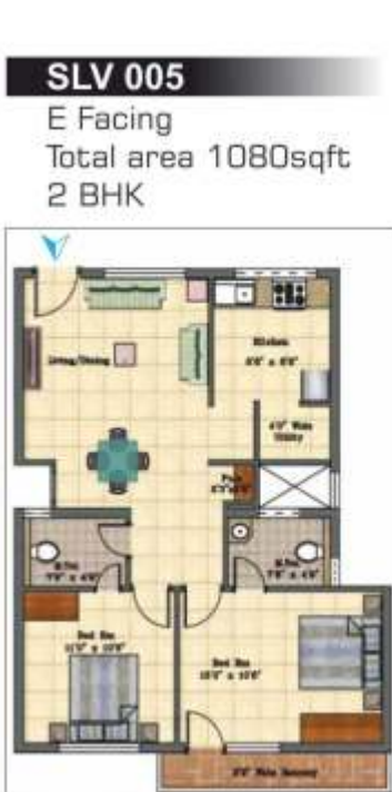
SLV 005 E Facing Total area 1080sqft 2 BHK