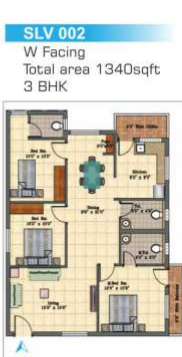
SLV 002 W Facing Total area 1340sqft 3 BHK